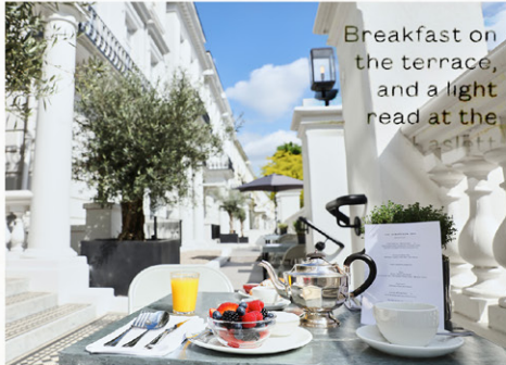
Breakfast on the terrace, and a light read at the Laslett.